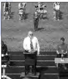
Mayor Gillock participates in Memorial Day Ceremonies at Ranger Stadium.