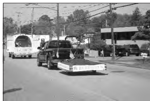
One of the many floats participating in this year's parade.