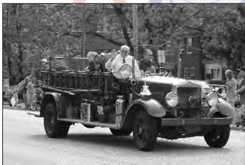
Mayor Gillock waves to the crowd from the North Ridgeville Fire Department's antique fire truck, "The Buffalo".