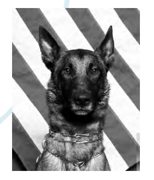
K-9 Duc K-9 Sinta