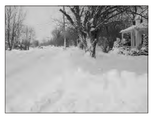
Looking north on Stoney Ridge Rd. after storm of February 14, 2007.