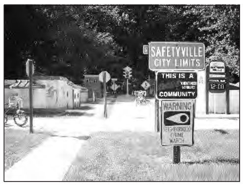
Safetyville before "Rush Hour".