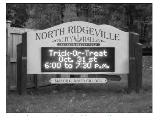
New city signs purchased with recycling grant monies.