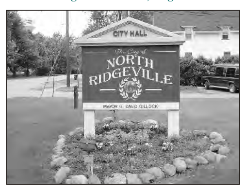
Another new sign purchased with recycling grant monies.