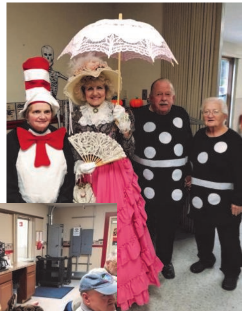
Halloween Costume Party Winners