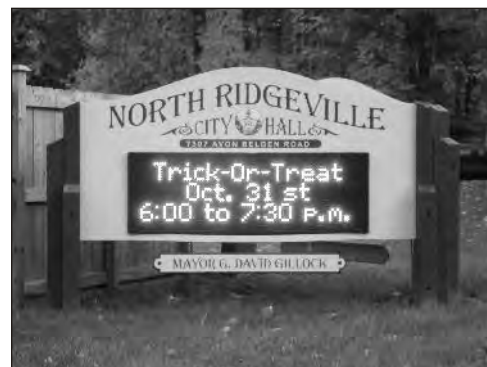
New city signs purchased with recycling grant monies.