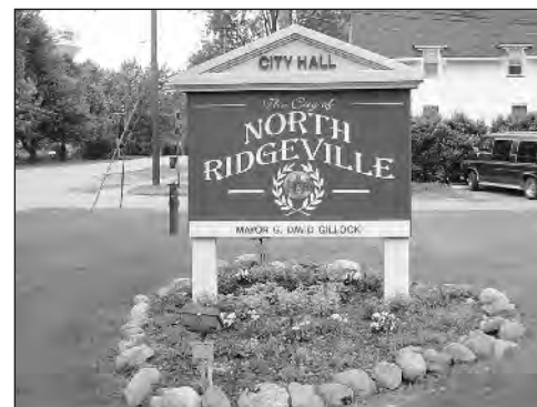
Another new sign purchased with recycling grant monies.