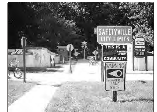
Safetyville before "Rush Hour".