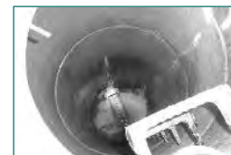
Sewer Pipe Installation