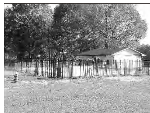
The new Splash Pad proved to be a popular attraction.