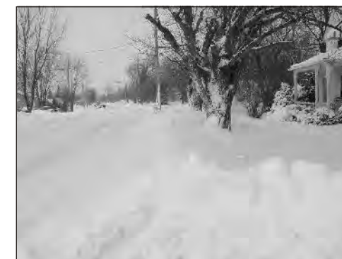
Looking north on Stoney Ridge Rd. after storm of February 14, 2007.