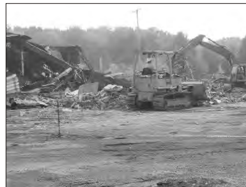
Moving toward a new, bright future.