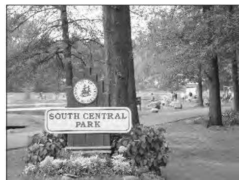
South Central Park during the annual Fishing Derby.