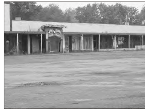
One last look at the past.